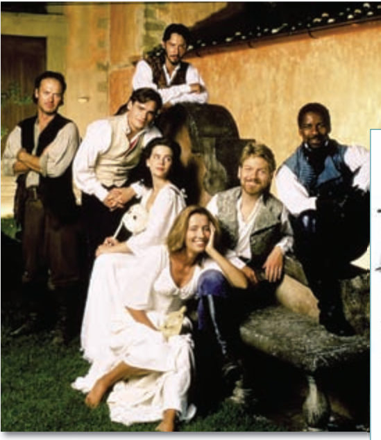
Actors from a popular 1993 film based on Shakespeare's Much Ado About Nothing

Shakespeare continues to influence modern culture, as the following images demonstrate.